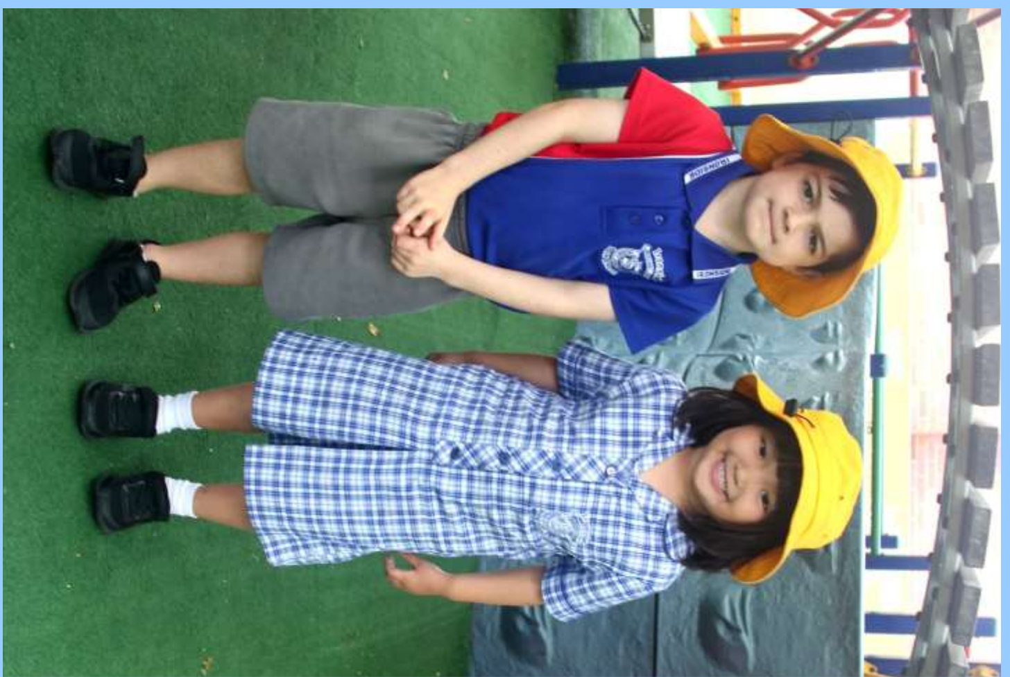
Prep at Ironside