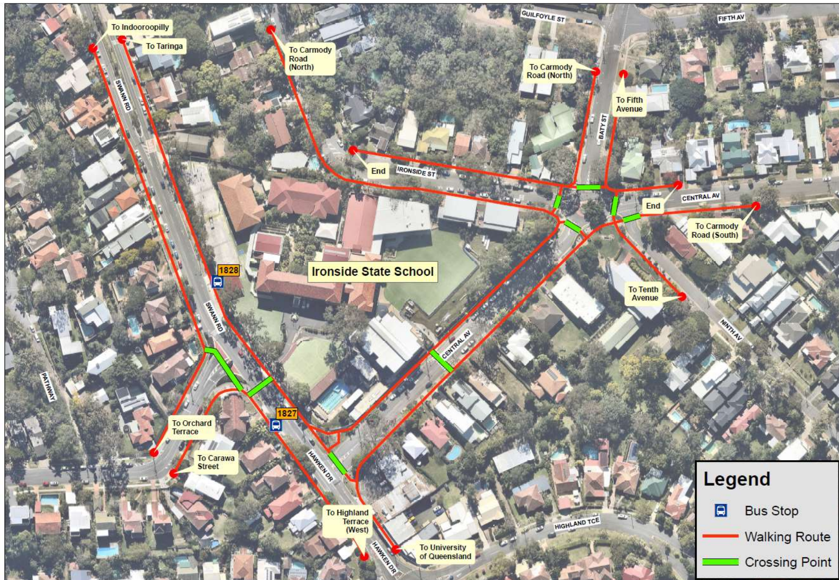
Figure 3: Map of walking and cycling routes, and public transport stops