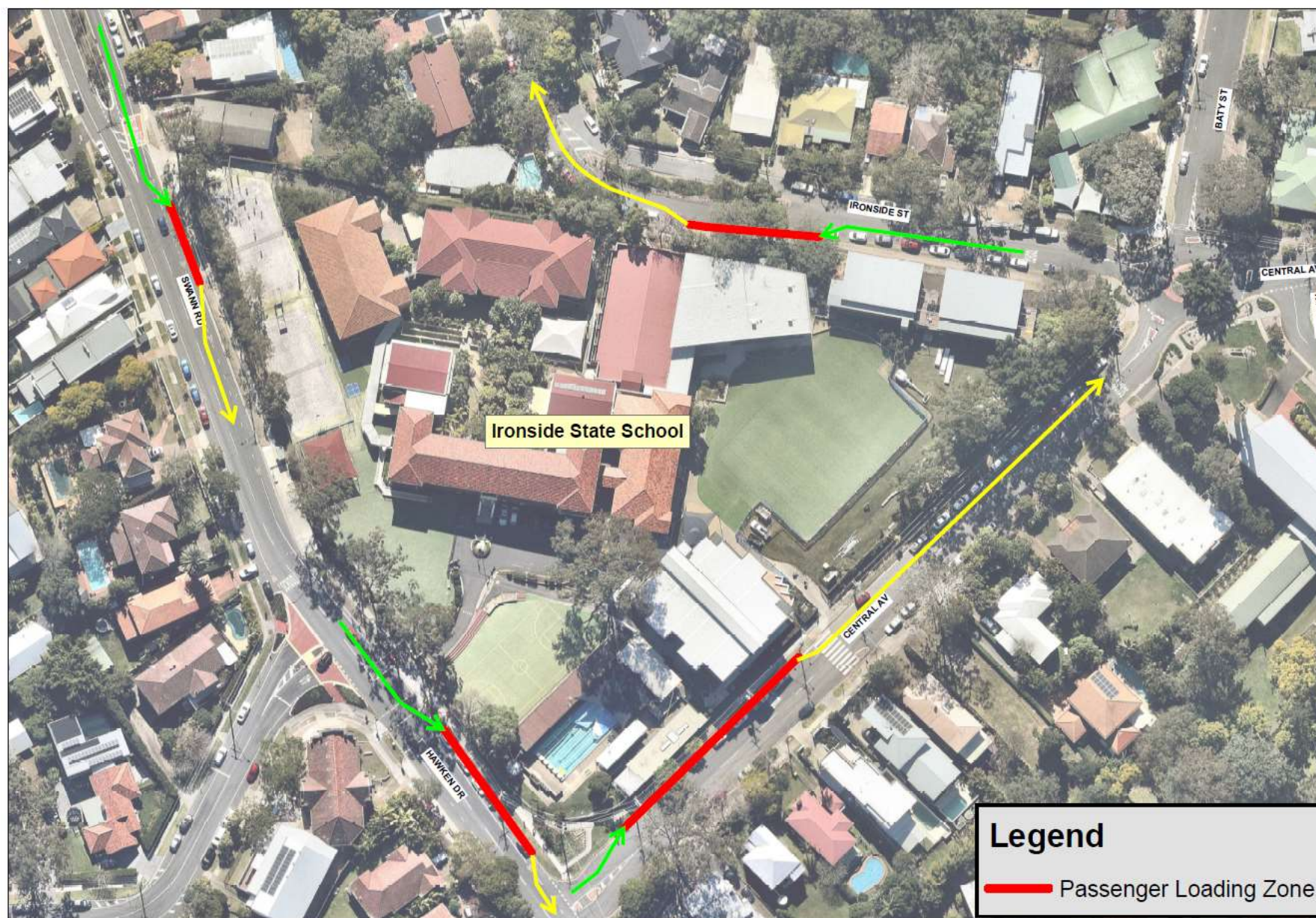
Figure 1: IRONSIDE SS (passenger loading) zones